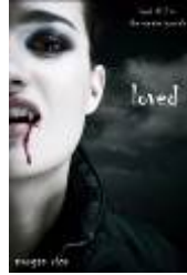
LOVED (Book #2 in the Vampire Journals)